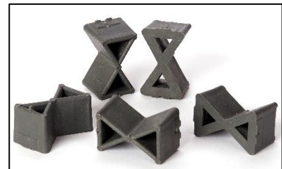
Attenuation Cell Cross Connector - Deep