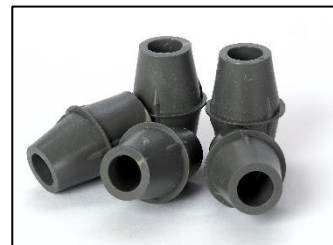
Attenuation Cell Shear Connector