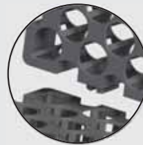
▲ Inter-locking mechanism of the panels