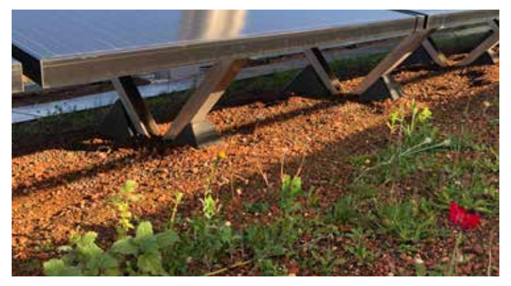
Flora 3 seed mix six months after seeding. Fully established vegetation will be seen at 12 months. This mix of seeds was chosen for the Department of Engineering rooftop as it provides a broad combination of low growing species and some shade tolerant vegetation, especially suited to BioSOLAR environments.

In addition to the BioSOLAR system, a blue roof was added to the build-up. Blue roofs are sustainable drainage solutions designed to manage stormwater on a flat roof to reduce water runoff rates and ease flash flooding and standing water in built up areas. The BauderBLUE Roof System attenuates water from a flat roof over a 24-hour period via a restrictive flow outlet. Calculations are carried out to determine the rate at which the water should egress the rooftop. This is determined by the local planning authority and for greenfield sites, this is often set as low as 5-8 litres per second per hectare. Bauder can design each flow restrictor to meet the necessary runoff rate. For the Department of Civil Engineering, the main roof area of 1455.5m² required two flow restrictors, each with flow control holes, to ensure the specified discharge rate of 0.77 litres per second was achieved. See overleaf for flow restrictor components.