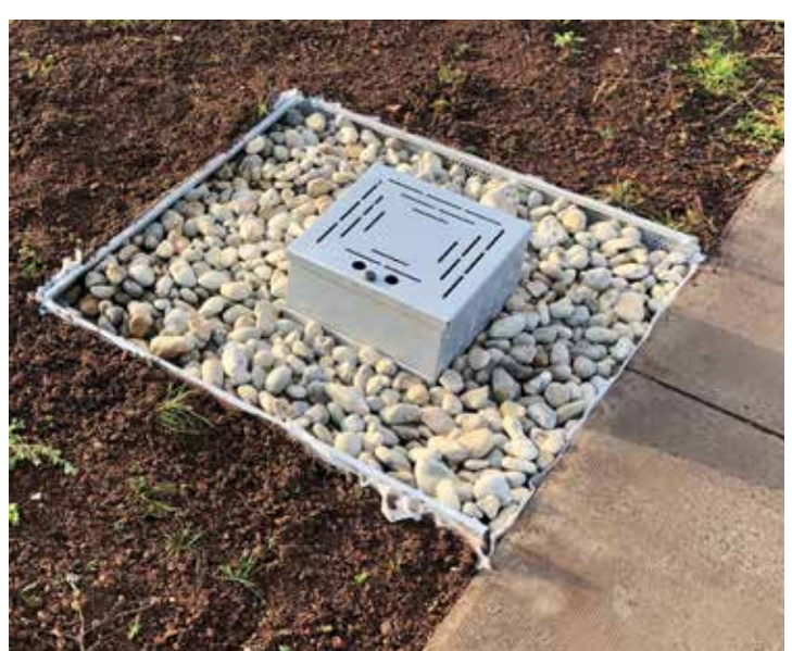
BauderBLUE ALU250 inspection chamber. As the total build-up of the bluegreen roof system was over 200mm, a 100mm height adaptor was added to ensure the top of the chamber was level with the surrounding landscaping. The barrier between the outlet and the vegetation comprises of 20-40mm rounded pebbles. This will prevent unwanted growth obstructing the drainage system.

The maximum depth of water the roof is designed for is the H-max. When the water level reaches H-max, it will drain via the overflow pipe. These overflow pipes are set at the same height as the H-max level. On this project the H-max was calculated to be 99mm. Although an unlikely scenario, this provision for a 'once-in-a-hundred-years' storm event will ensure that the structural integrity of the building is always preserved.