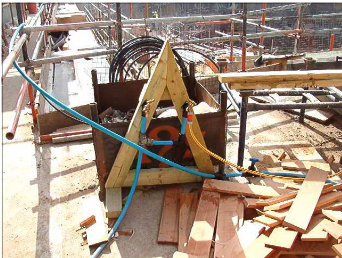
An example of a temporary watering system rigged up on site to provide an adequate mains watering feed to different roof areas.