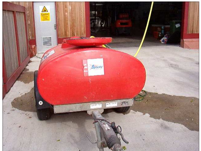
In situations where the mains water pressure is found to be insufficient, a Bowser can be used together with a pump, to provide the required pressure to roof level.